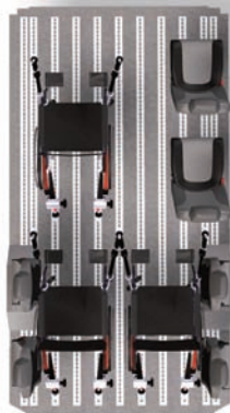
2 seats, 4 folding seats 3 wheelchairs