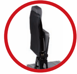
Clever folding feature