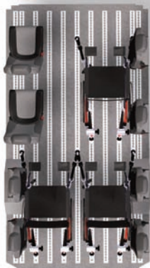
2 seats, 8 folding seats 3 wheelchairs