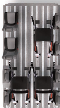
2 seats, 4 wheelchairs