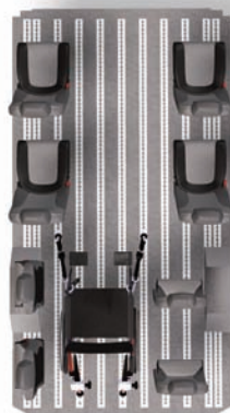
4 seats, 4 folding seats 1 wheelchairs