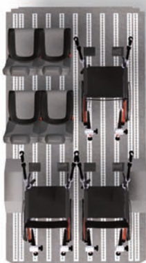
4 seats, 3 wheelchairs