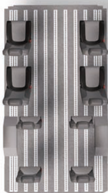
4 seats, 4 folding seats