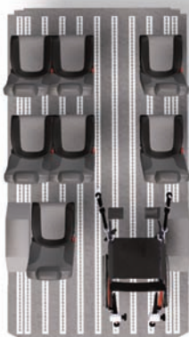
7 seats, 1 wheelchair