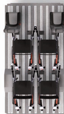
2 seats, 4 wheelchairs