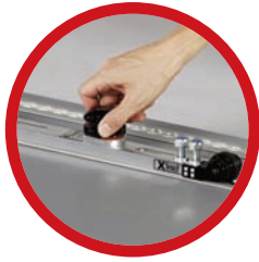
Easy to mount