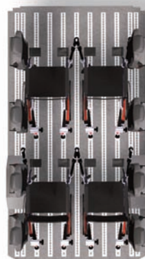
8 fold. seats, 4 wheelchairs