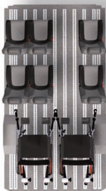
6 seats, 2 wheelchairs