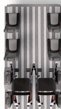
4 seats, 4 folding seats 2 wheelchairs